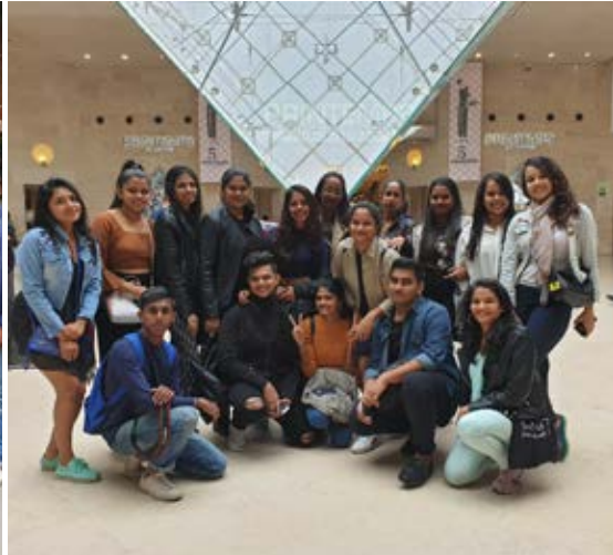
Visit to Louvre Museum