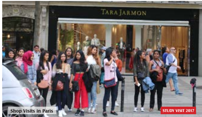
Shop Visits in Paris