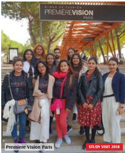
Premiere Vision Paris