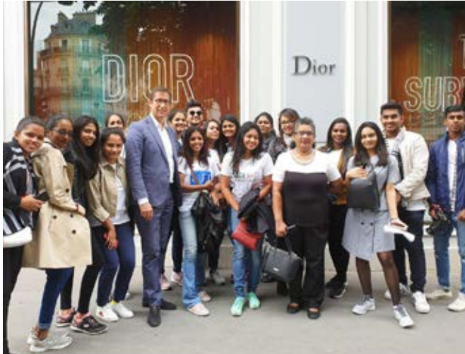
Visual Merchandising Visits at Dior Flagship store