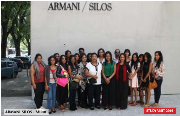
ARMANI SILOS - Milan