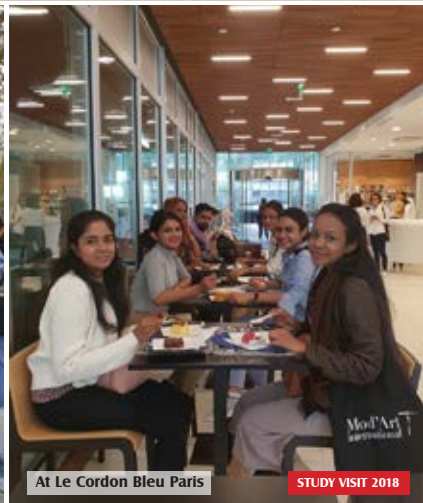
At Le Cordon Bleu Paris