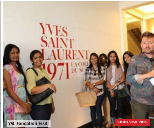
YSL Fondation Visit